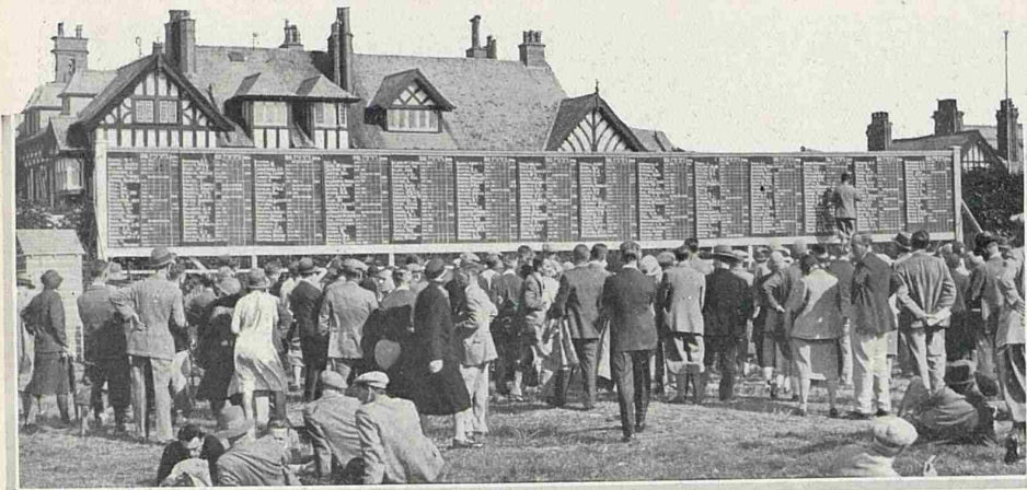
WATCHING THE NUMBERS GO UP: THE CROWD FOLLOW THE PROGRESS OF THE ROUNDS ON THE SCORE BOARD AT HOYLAKE DURING THE LAST DAY'S PLAY OVER THIRTY-SIX HOLES.