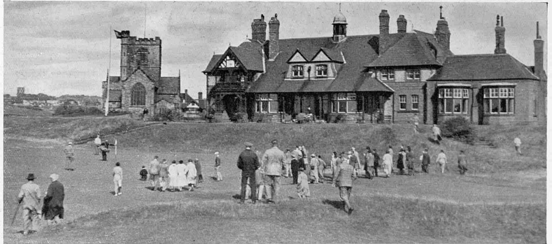
AT WALLASEY: The Home Green. This hole has been extended to 410 yards, and, unless the drive is well placed, the ridge in front of the green obscures the view for the approach. Heaven help the man who needs a 3 to qualify! The Golfers' Church is seen in the background. It has a stained glass window depicting incidents in the game of golf.