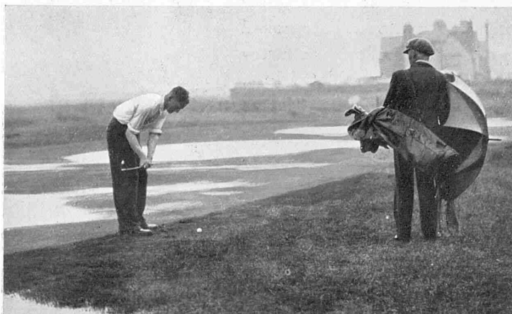
(Left) AQUATIC GOLF: Showing the approach to the 17th green after the storm had done its worst. Clearly in such conditions golf must degenerate into a farce.