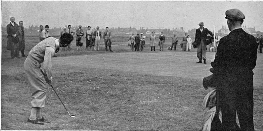
A NEAT PITCH: By A. D'A. Locke, from the back of the 15th, which, however, failed to stop near the hole.