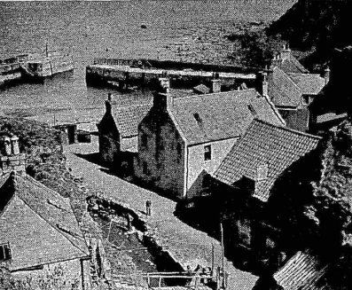
The little fishing village of Pennan, Aberdeenshire, which was included in the auction of the estate of Auchinmadh at Banfer yesterday. The new landed proprietor of the village is former postmaster.